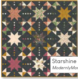
Starshine (66" x 66") ModernlyMorgan.com