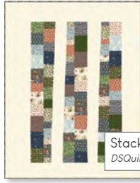
Stacking the Odds (68" x 88") DSQuilts.com

TOTAL ESTIMATED YARDAGE: 6 1/4 BACKING: 4 1/4 YARDS OR 108" WIDEBACKING: 2 YARDS