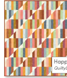
Happy Stripes (56" x 64") QuiltyLove.com

TOTAL ESTIMATED YARDAGE: 6 7/8 BACKING: 5 1/4 YARDS OR 108" WIDEBACKING: 2 1/8 YARDS