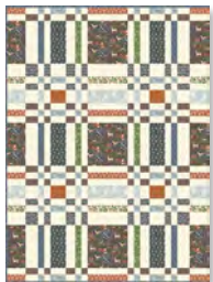
Woven (66.25" x 89.75") DSQuilts.com

TOTAL ESTIMATED YARDAGE: 11 3/4 BACKING: 8 YARDS OR 108" WIDEBACKING: 2 2/3 YARDS