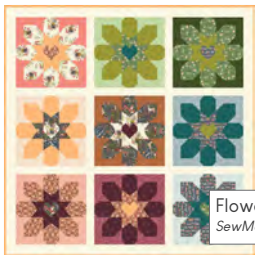
Flower Love (64" x 64") SewMariana.com

TOTAL ESTIMATED YARDAGE: 5 1/2 BACKING: 3 5/8 YARDS OR 108" WIDEBACKING: 1 7/8 YARDS