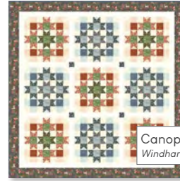
Canopy of Stars (88" x 88") WindhamFabrics.com