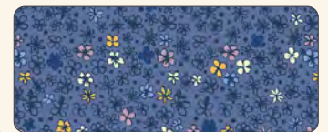
53968W-2DES Blue Jay