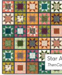
Star Adventure (69" x 83") ThenCameJune.com