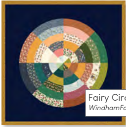
Fairy Circle (84" x 84") WindhamFabrics.com