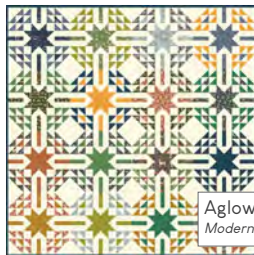
Aglow (64" x 64") ModernlyMorgan.com

TOTAL ESTIMATED YARDAGE: 7 1/2 BACKING: 4 1/2 YARDS OR 108" WIDEBACKING: 2 YARDS