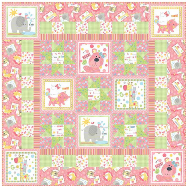
Pink color combo

Be sure to visit www.windhamfabrics.com to see the complete collection and to download this and other Free Projects