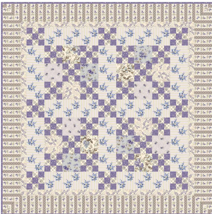
Blue Version of the Quilt