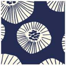
33404-3 Deep Indigo