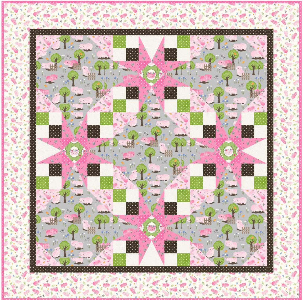
THIS IS A DIGITAL REPRESENTATION OF THE QUILT TOP, FABRIC MAY VARY.

PLEASE NOTE: BEFORE MAKING YOUR PROJECT, CHECK FOR ANY PATTERN UPDATES AT WINDHAMFABRICS.COM'S FREE PROJECTS SECTION.